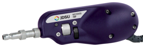
Easily inspect bulkhead sides