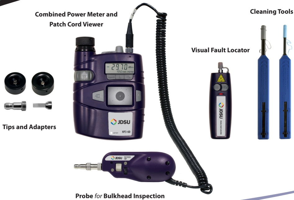
Combined Power Meter and Patch Cord Viewer