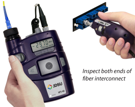
Inspect both ends of fiber interconnect